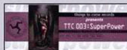
things to come records TTC-003 12" Vinyl EP SuperPower "The Future Crusade"